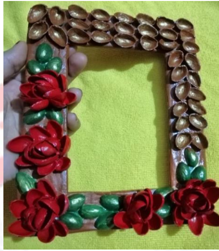
Class 5 th E