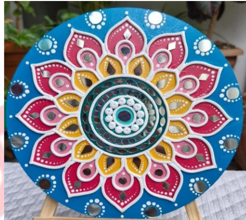
Class 5 th B