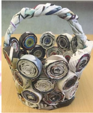
Class 5 th K